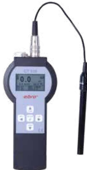
CT 830 Conductivity Meter