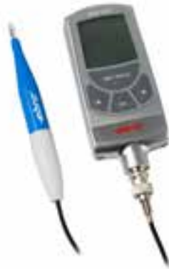
PHT 810 + AT 206