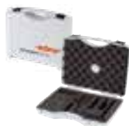
AT 100-PHT Carrying case