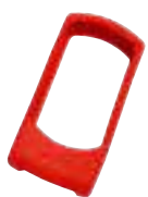
AG 140 Protective cover for handheld devices, red