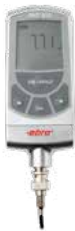
PHT 810 pH Meter

For professional use one can select from the following range: PHT 810 pH meter instrument and PHT 830 pH meter, temperature compensated, with a variety of different electrodes, and the CT 830 conductivity measurement instrument, temperature compensated.