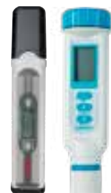
pH and Conductivity Standard Tester