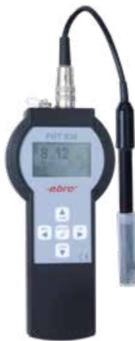
PHT 830 pH Meter