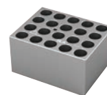
DB 4.4 Single block Suitable for: Standard test tubes