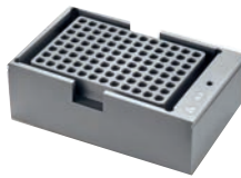
DB 6.3 Double block Suitable for: PCR-plates, tubes, strips