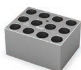
DB 2.1 Single block Suitable for: Conical tubes