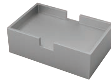
DB 7.1 Double block Suitable for: Microtitre plates