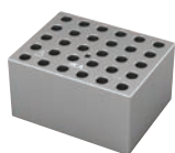
DB 1.1 Single block Suitable for: PCR tubes

* Dimensions (W × H × D): 95 × 76 × 51 mm