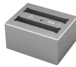
DB 8.1 Single block Suitable for: Cuvettes