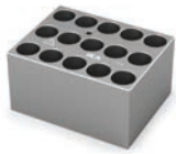
DB 5.9 Single block Suitable for: 16 mm vials

* Dimensions (W x H x D): 95 x 76 x 51 mm ** Dimensions (W x H x D): 95 x 152 x 51 mm