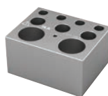
DB 3.2 Single block Suitable for: different reaction vials